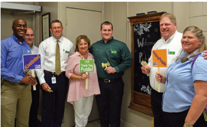
Managers from Publix stores around the River Region toured the Children's Center Adult Program on "United Way Day."