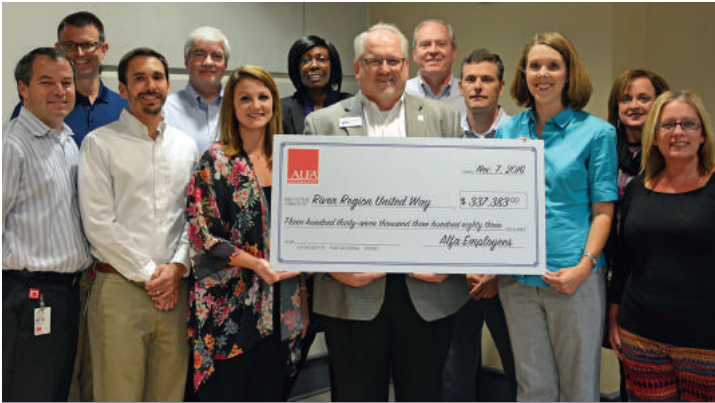
Alfa associates who currently volunteer with RRUW, or have volunteered in the past, presented a check for pledged employee contributions.

Together, we are making life better for everyone in the River Region, through our work in the areas of Education, Income Stability and Health.