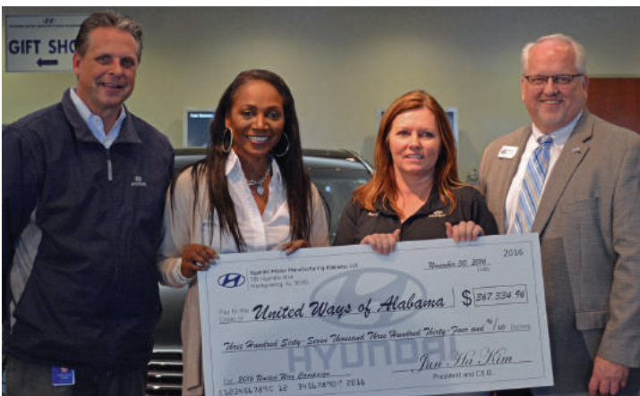
Hyundai Motor Manufacturing Alabama: HMMA Team Leaders for the 2016 United Way Campaign with a check presented to the United Ways of Alabama.