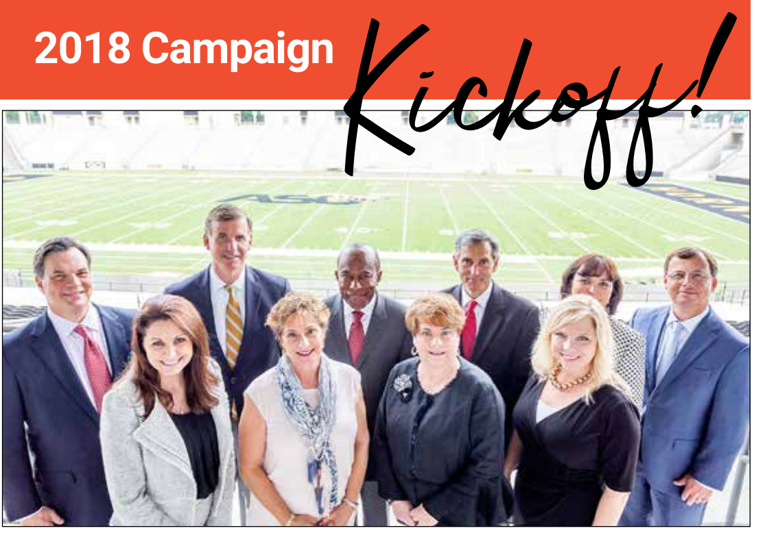
2018 Campaign Cabinet members at an orientation and training event hosted by ASU.